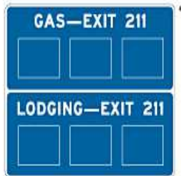
SINGLE-EXIT INTERCHANGE (TWO SERVICES)