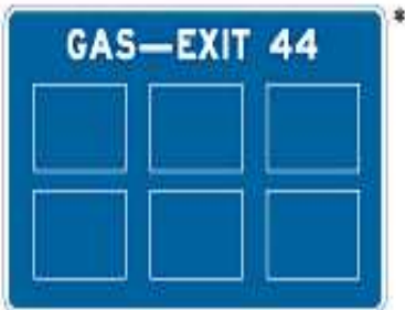
SINGLE-EXIT INTERCHANGE (ONE SERVICE)

* See Section 2F.07 for option of putting exit number on a separate plaque instead of on the sign